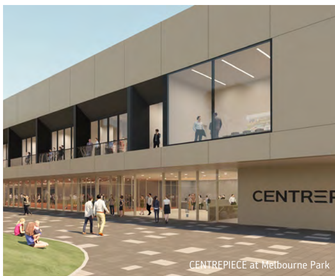
CENTREPIECE at Melbourne Park

* Open dates are correct at the time of publishing in December 2020