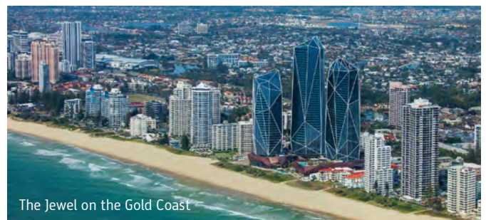
The Jewel on the Gold Coast